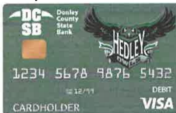
Hedley Owls School card